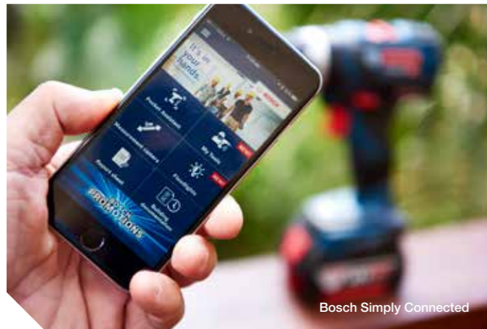
Bosch Simply Connected

It was from these beginnings Bosch grew into the global leader it is today. With innovation remaining one of the strengths of its range, 2017 is another stellar year for Bosch. It's Bluetooth-enabled cordless power tools and the release of a high density battery have yet again met the consumer's demand for smarter, tougher and more powerful cordless power tools. WTV