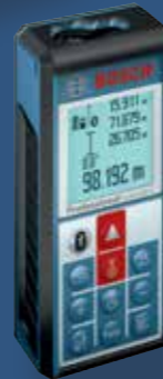
Bluetooth range finder