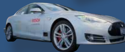
Australia's first Highly Automated Driving Vehicle